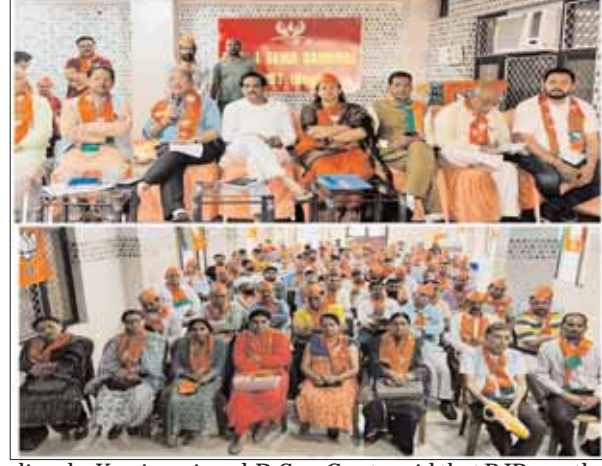
digarh, Kunjwani and R S Pura. Addressing the meeting,

To make an appeal in this regard, he chaired a meeting of five BJP mandals falling in Jammu district (South) including Trikuta Nagar, Gandhi Nagar, Gad-